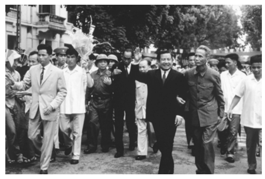
Prince Sihanouk with Vietnamese Premier Phan Van Dong in Hanoi on May 25, 1970.

VIII | THE KHMER REPUBLIC 1970 - 1975 K4 MEDIA SAMPLE ONLY | IX